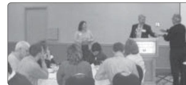
PDM door prize winner.